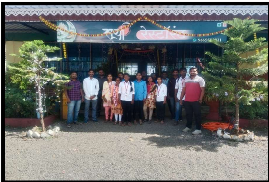
Field Visit Method – Hotel