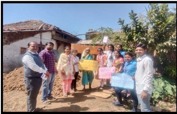
Field Visit – Chichondi Gram Panchayat