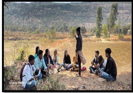
Field Visit - Singing Song and Poetry