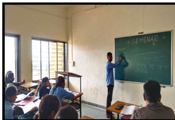
Backboard and chock